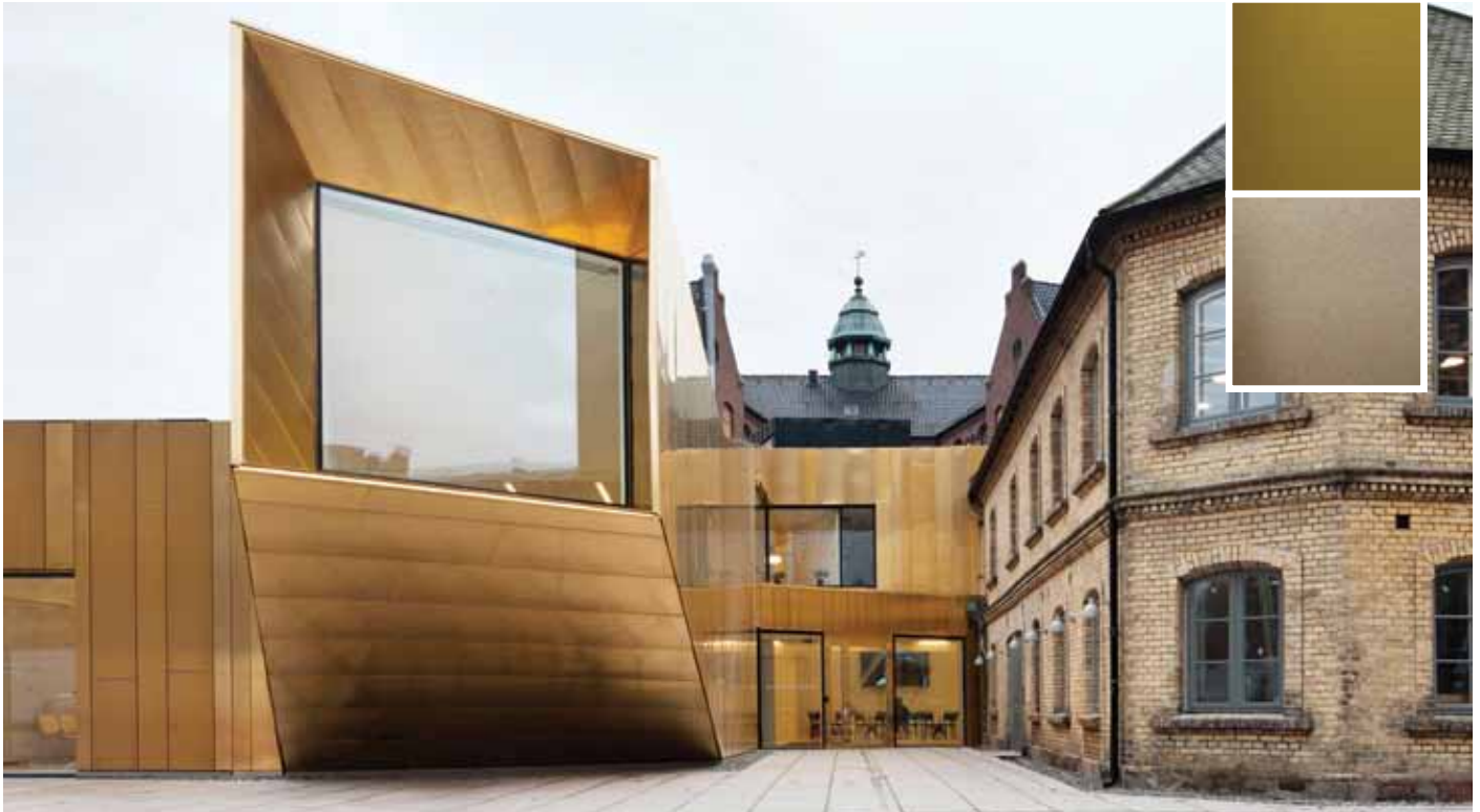
Lund Cathedral Visitor Centre, Sweden; Architect: Carmen Izquierdo.