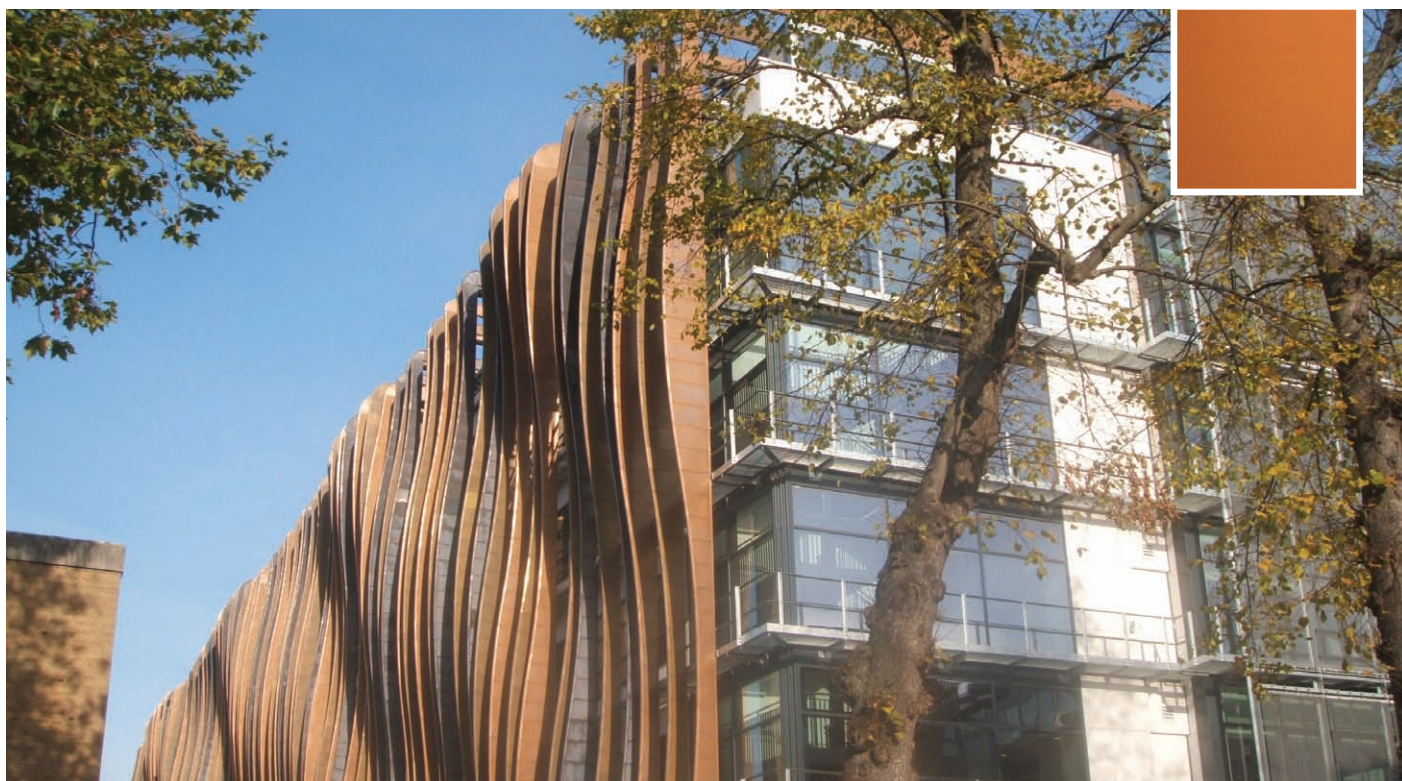
Vertical solar shading fins, each clad in either Nordic Bronze, Nordic Brass or Nordic Brown™. Holland Park School, London; Architects: Aedas.